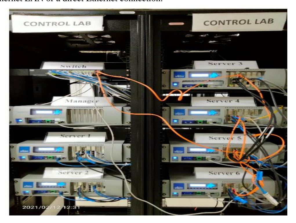
Fig 1: Control Lab Set-up